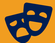
Speech and Drama