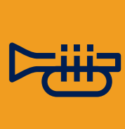
Trumpet and Trombone