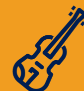
Violin and Viola