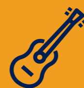
Guitar (Acoustic, Bass and Electric)